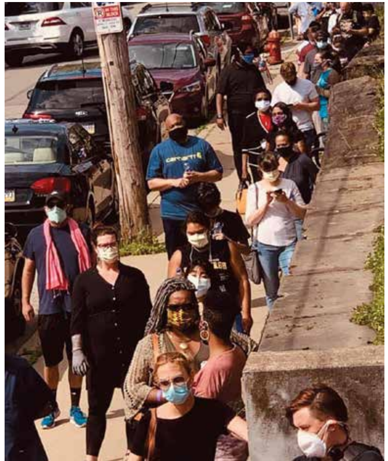
Voters wait to vote at a Pittsburgh-area polling station in June.

For more information, visit https://www.pavoterservices.pa.gov or call my office at 412-781-2750 for assistance.